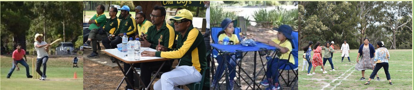
Cricket and Family Fund Day - January, 2020