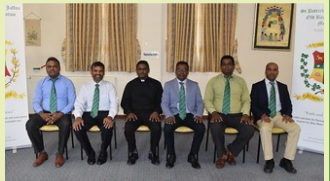
St. Patrick's Day and AGM - March, 2021