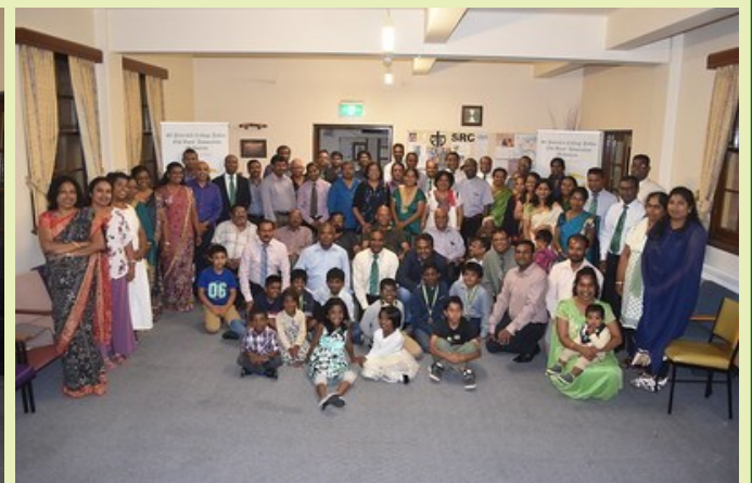
Office-bearers, Committee Members and participants at St. Patrick's Day Celebrations - March, 2019