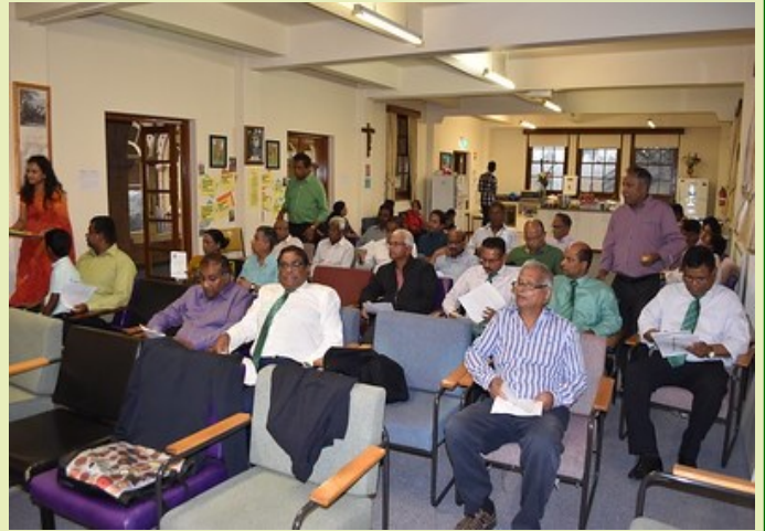
AGM in progress - March, 2018