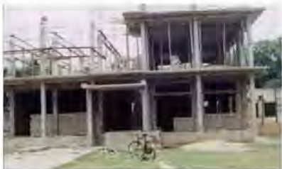
Long Block during construction