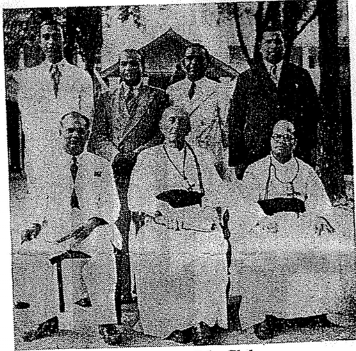
The Dramatic Club.