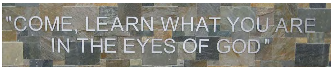
Iona College Crest & Motto