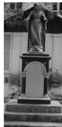
Our Lady of the Patricians

Following years the State Education Policy came under severe criticism. The opinion had become very widespread that "The Christian Community enjoyed a social and economic advantages through schools managed by their respective denomination, which the state paid for". The Buddhist committee set up in 1954 by All Ceylon Buddhist Congress, pointed out that the social and economic life of the Buddhists was very badly affected and the fundamental cause was the dual control in education. The committee urgently recommended that all Assisted Schools should be taken over by the Government..