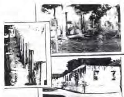
Upper School Buildings damaged by Bombing