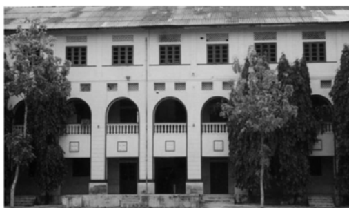
Part of the Matthews Block

The Education (Amendment) Act No. 5 of 1951 provided for a reclassification of grants given to the Assisted schools. This Act laid down conditions on assisted schools. This widened the state's responsibility for education and brought all Unaided, Assisted and Government schools under one system, and the Assisted schools should adhere to the state's policy regarding the medium of instruction. While accepting the policy of the Government regarding the medium of instruction, St. Patrick's objected that its sudden implementation would result in some ill-effects. The college gradually gave a new orientation in education towards self-reliance and practical work.