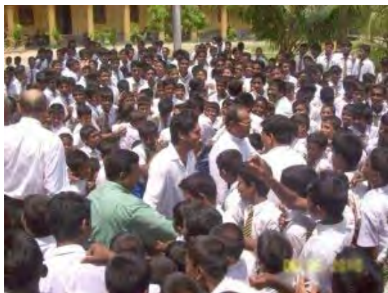
Sangakkara's visit St. Patrick's College, Jaffna