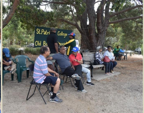
January 27, 2019