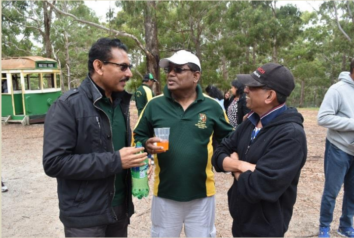
January 26, 2017