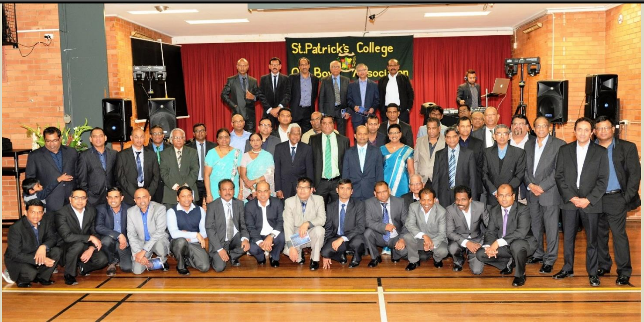
Patrician Nite 2016