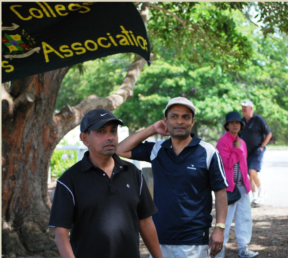
26 January, 2010