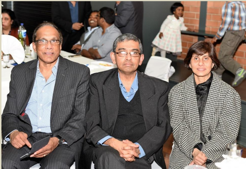
Patrician Nite 2016